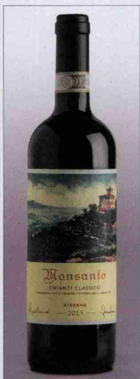
CASTELLO DI MONSANTO Chianti Classico Riserva 2015 (94, $25) SMART BUY Firm; cherry, black currant, leather, iron, tar